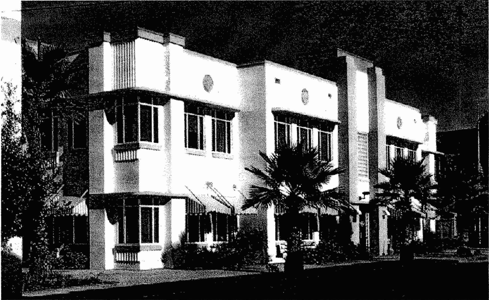
PUBLIC DEFENDER BUILDING (Dedicated November 14, 1998)

BOARD OF COUNTY COMMISSIONERS FISCAL YEAR 2000 - 2001 FINAL BUDGET