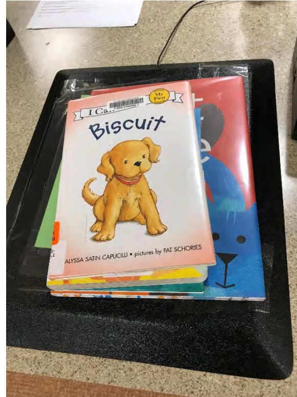
I place my books on the pad.