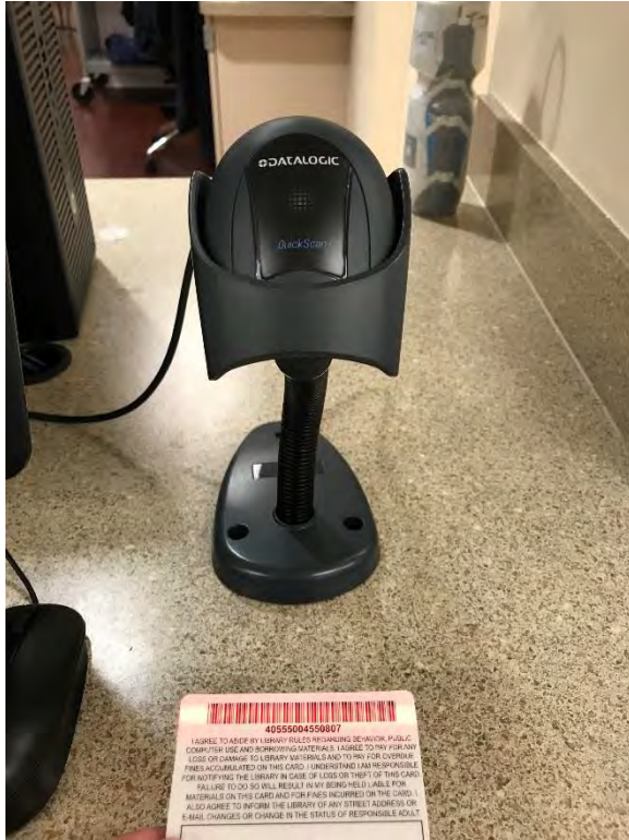
I scan my card.