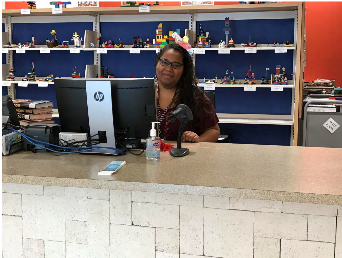
This is a desk with a friendly person.