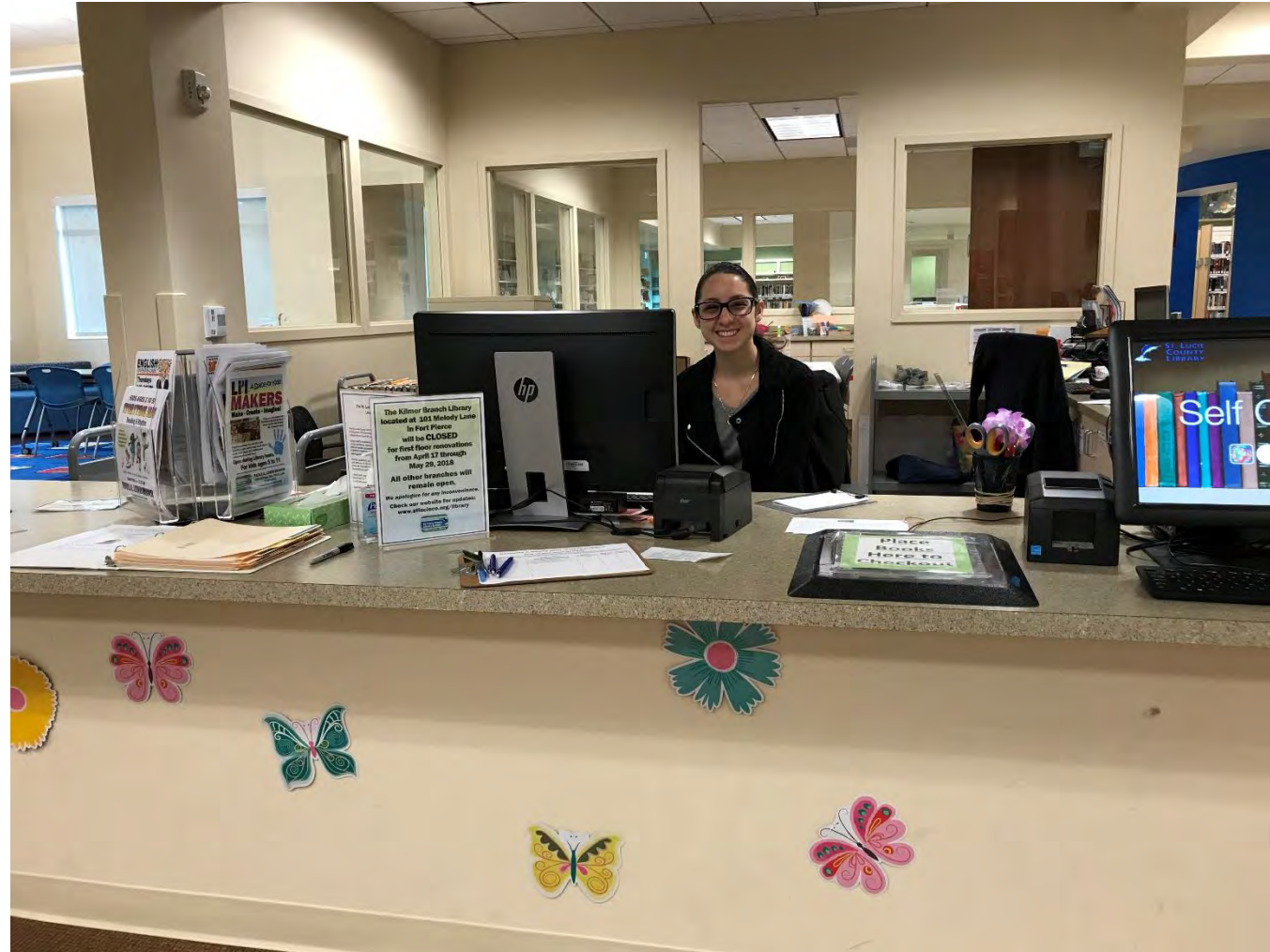
This is the Children's desk. I can ask the friendly person to help me find a book.