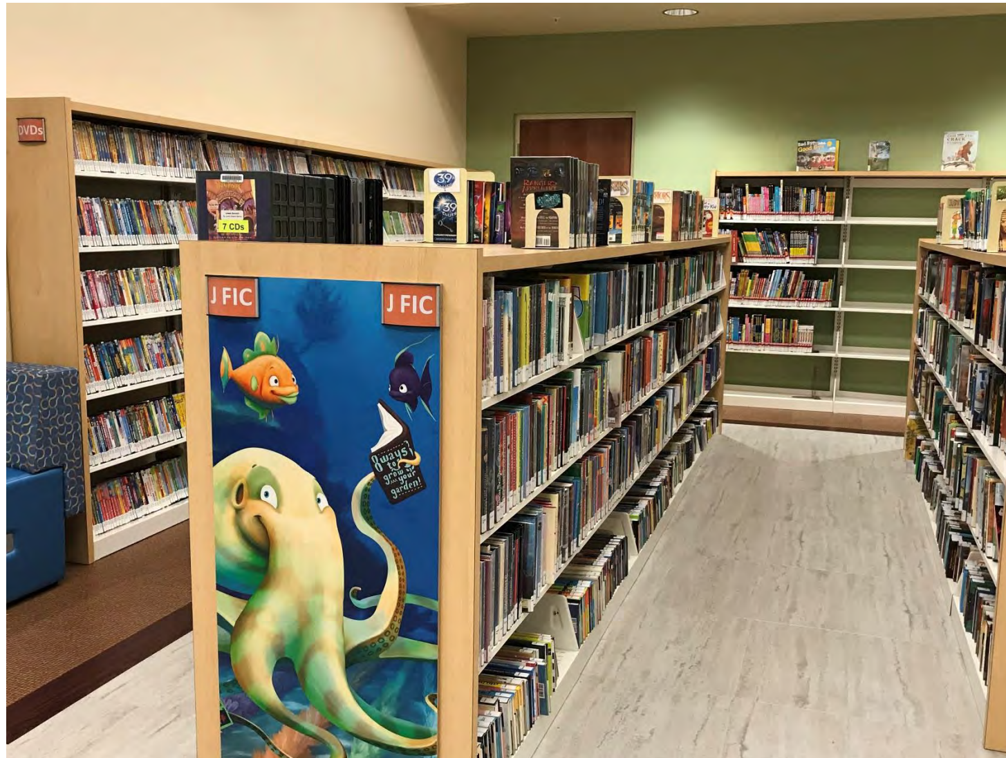
There are many books and DVDs in the Library.